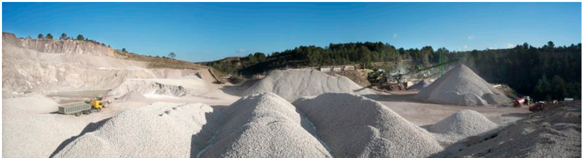
Cales de Llierca, S.A. Afores s/n | ES-17853 Argelaguer (Girona) | Spain