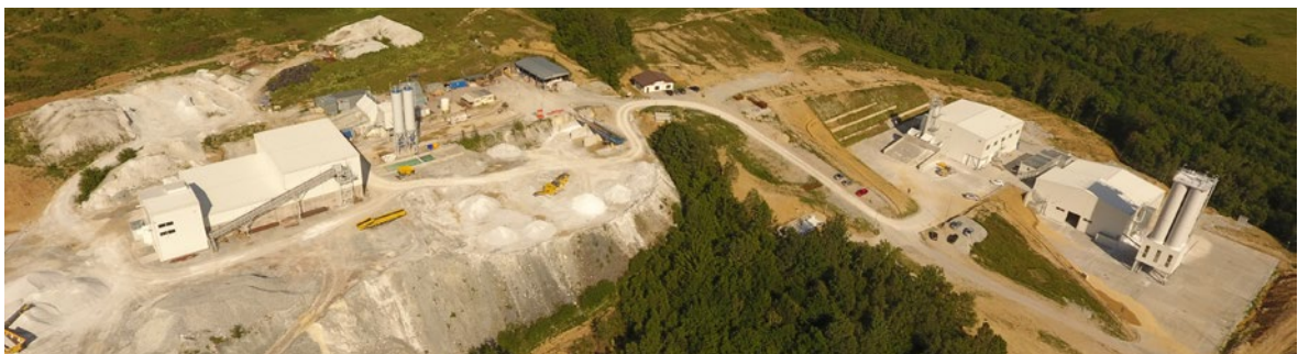
euroTalc s.r.o. Štôľňa Elisabeth 1 | SK-049 22 Gemerská Poloma | Slovakia