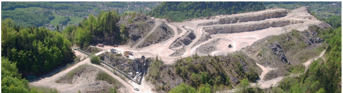
Calmit GmbH Linzer Straße 8 | AT-4820 Bad Ischl | Austria