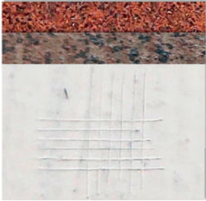
With Anticor™ RCP